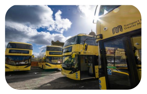
Invested in new electric buses and new services