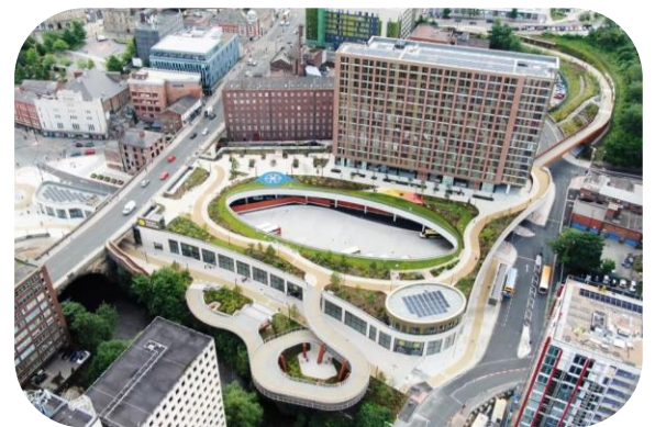
Built modern facilities, unlocking development