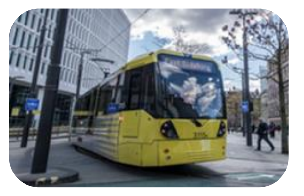
Achieved record Metrolink patronage