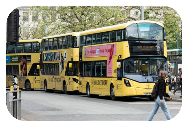
Increased bus use and improved reliability