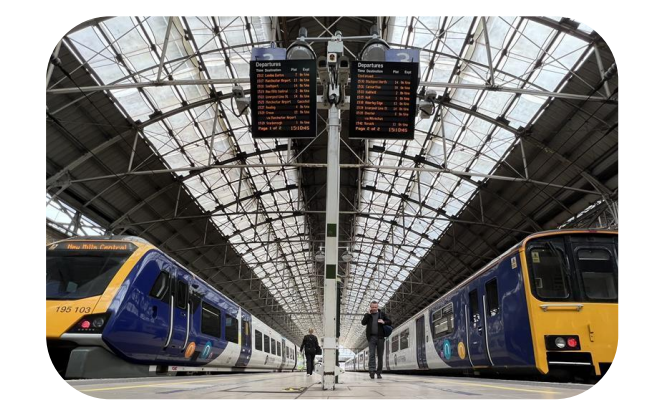
Called for rail service and infrastructure improvements